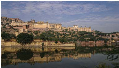
02 - Amer Fort reflected.JPG

Exciting, fun image; facial expressions capture the moment. ****