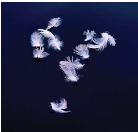
24 - Western Gull Feathers at Moss Landing_.jpg Kent Van Vuren Beautiful simplicity. Great composition; sharp and detailed. Well done. *****