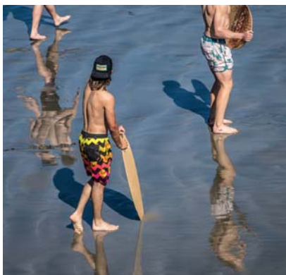
04 - At the Beach.jpg

Great haute shot. Colors may be realistic, but they are a bit overpowering. ***