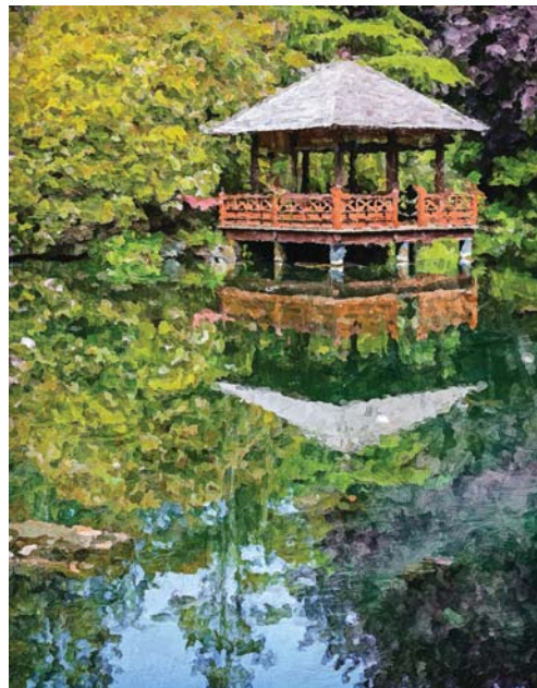
Impressions - Gazebo on a Pond Rick Verbanec