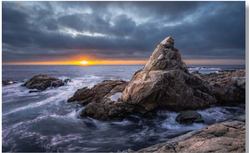
Matterhorn Rock Garrapata State Park