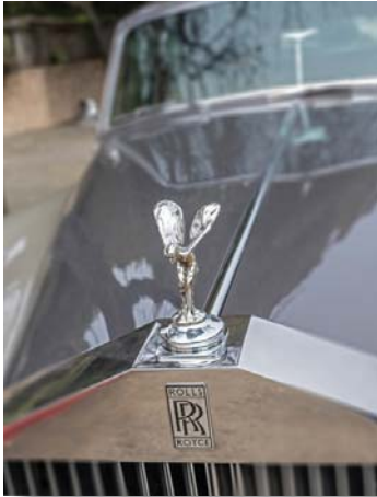
22 - Spirit of Ecstasy.jpg Karen Schofield Creative, interesting subject matter. Strong tonal range. ****