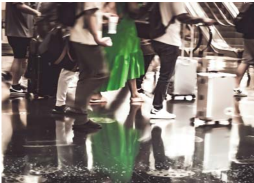
23 - The Green Dress.jpg Nicole Asselborn Intriguing, great post-work. Very spot-modern look. *****