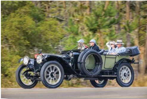
01 - A Run on the Tour d'Elegance.jpg