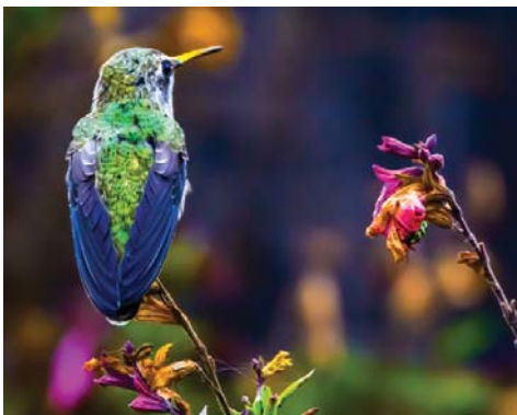
03 - Anna's Hummingbird front yard.jpg

Outstanding composition. Nice use of natural colors. *****